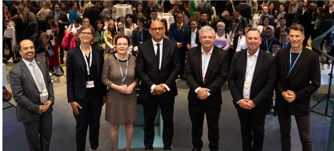
On 3 June, the SB60 reception hosted by UNFCCC, the Federal City of Bonn, and the German Government marked the launch of the Daring Cities 2024 Bonn Dialogues.

mobilizing delegations, and bridging dialogue between the UNFCCC Secretariat and subnational governments. In this role, we brought the key findings from Cornerstone II “Exchange” to COP29 in Baku, Azerbaijan, to help guide the climate agenda forward into 2025 and beyond.