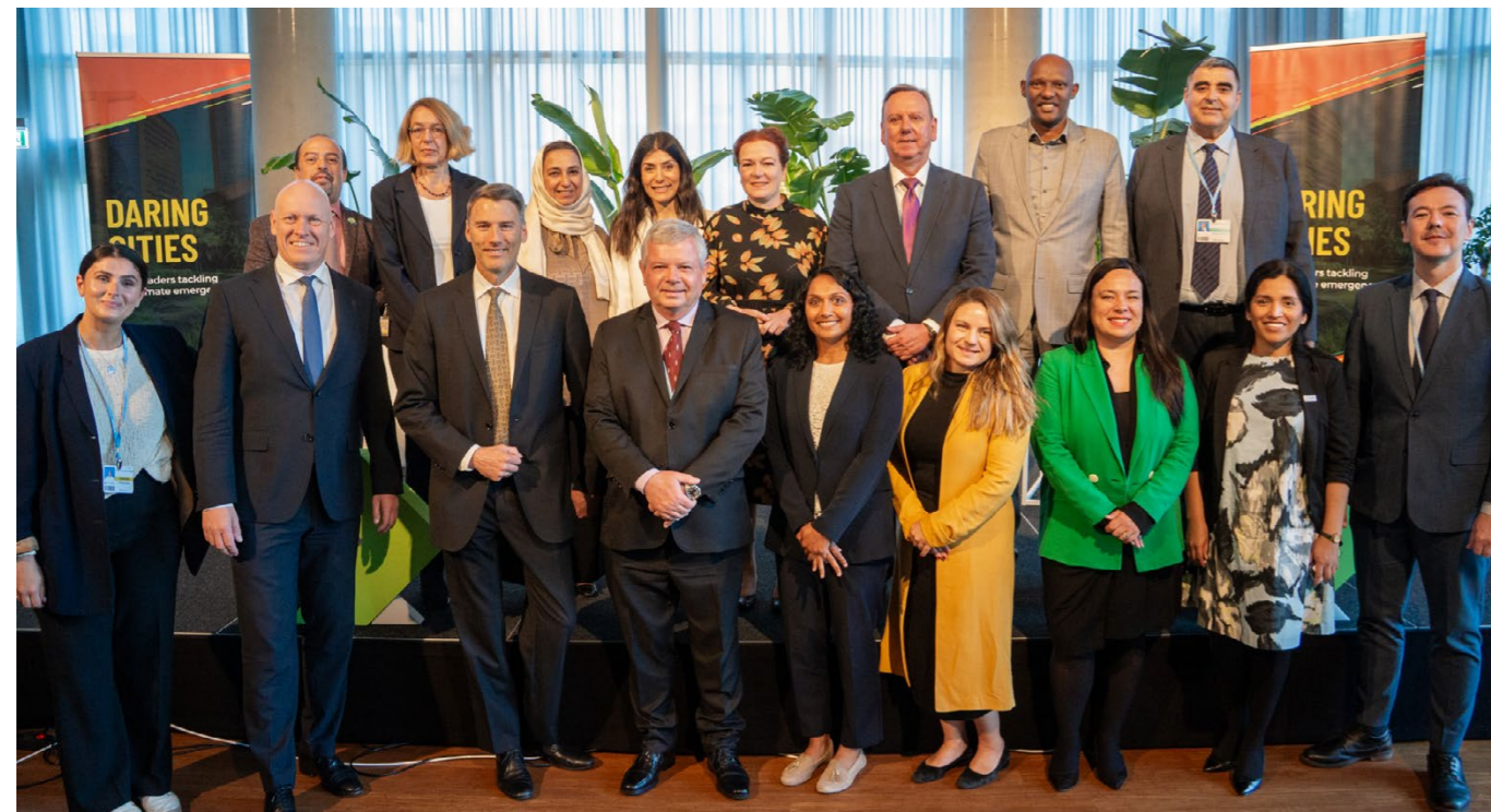
Daring Cities representatives, along with national and local government leaders and partners, gathered on 4 June for the kickoff of the Daring Cities 2024 Bonn Dialogues in Bonn, Germany.