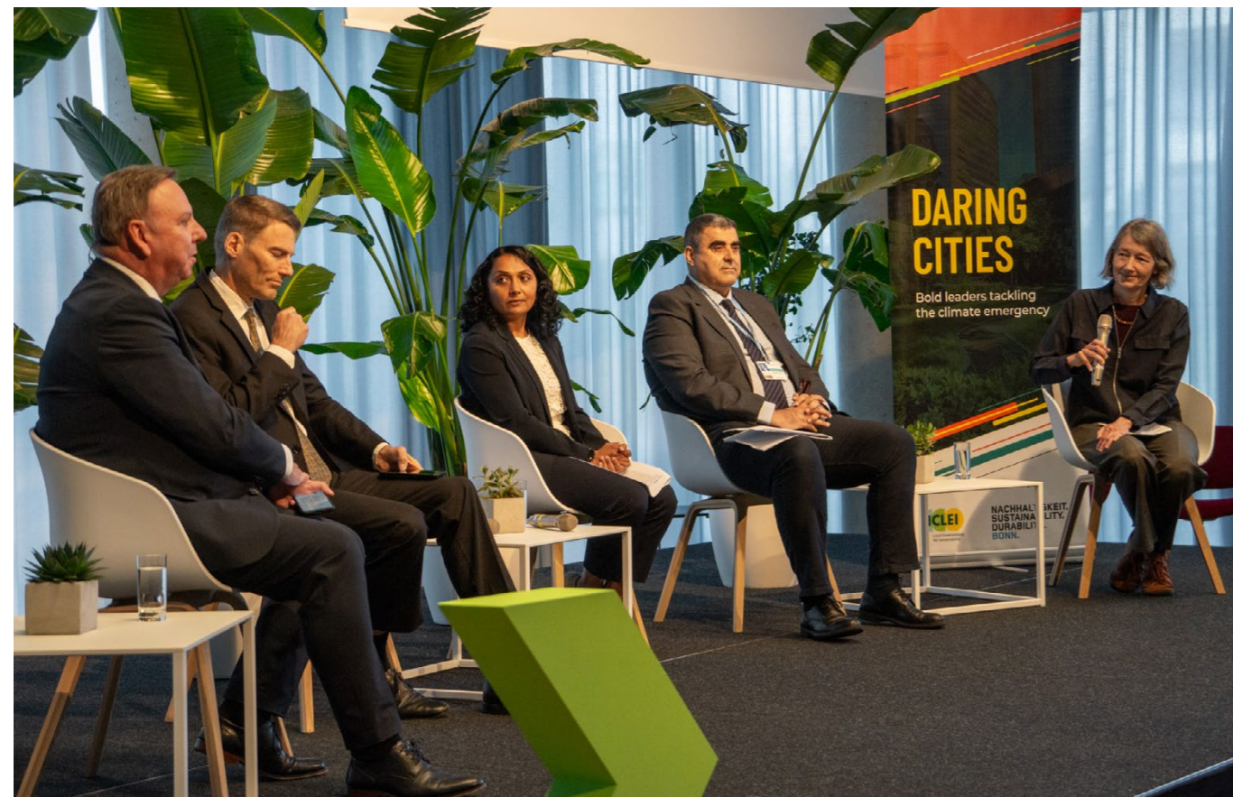
Plenary on multilevel action at the Daring Cities 2024 Bonn Dialogues.