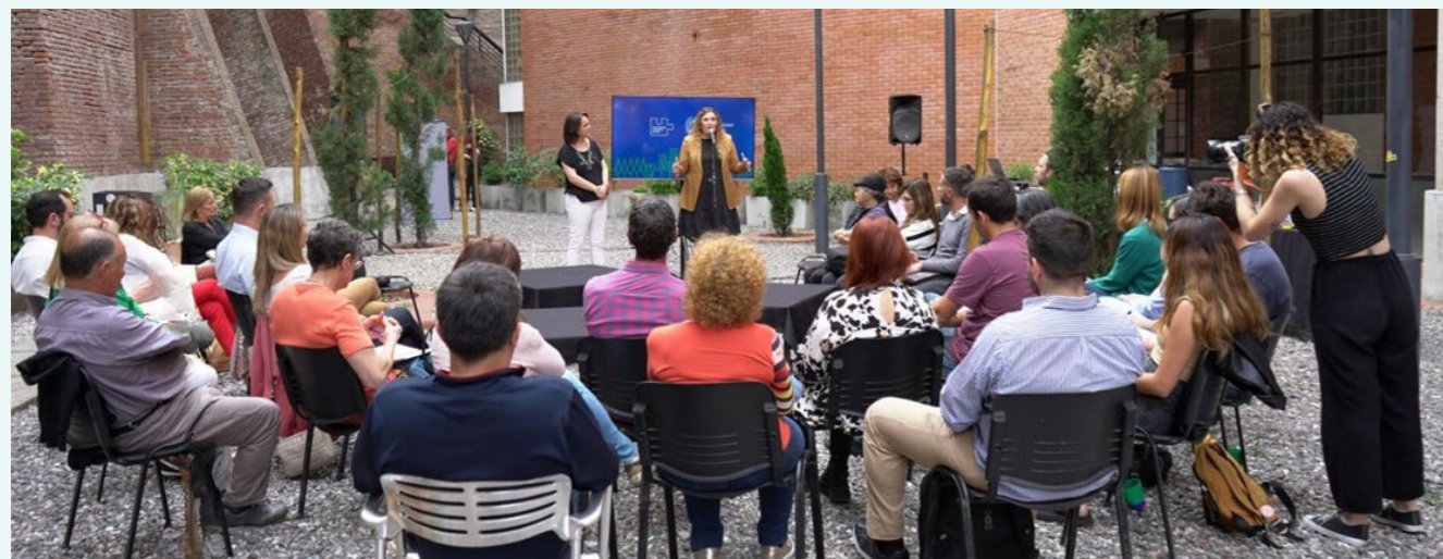
Rosario's local stocktake gathered residents and municipal authorities to discuss the Local Climate Action Plan, which aims to reduce greenhouse gas emissions by 22% by 2030.

▶ Watch the session “CHAMP & Town Hall COPs: Connecting local climate action to national and global goals”