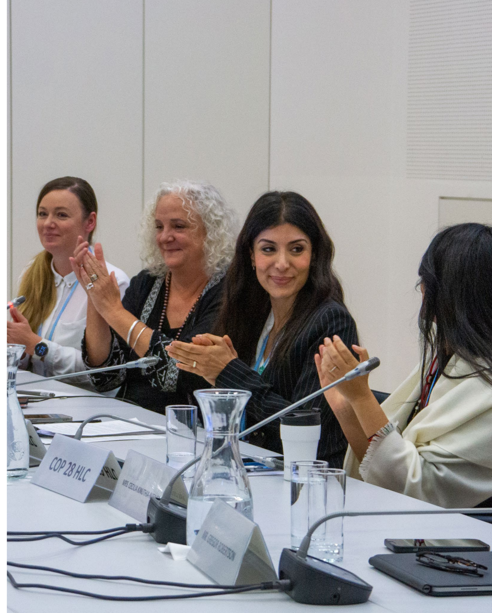
Daring Cities 2024 Bonn Dialogues at the SB60 sessions.