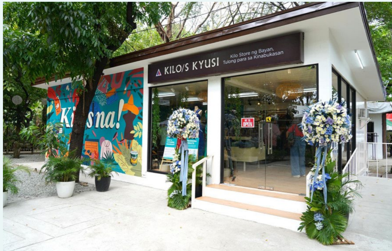
Quezon City's Kilo/s Kyusi Kilo Store is the first permanent shop selling preloved and new clothes donated by residents.

▶ Watch the session “Beyond the bin: Circular solutions for urban waste in Southeast Asian cities”