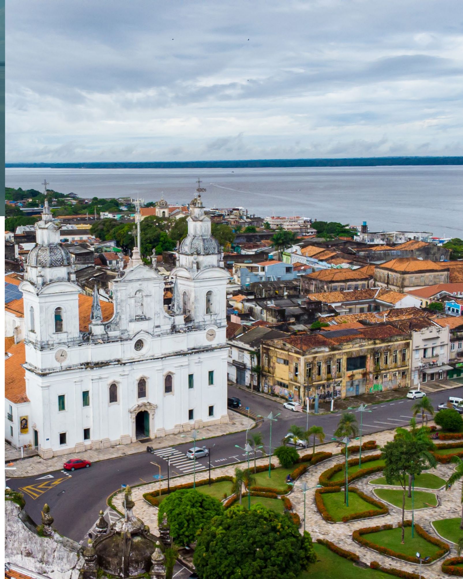
Belém, Brazil, will host COP30 from 10 to 21 November 2025.

As we carry the momentum from Daring Cities 2024 into 2025, we remain committed to advancing multilevel action through the CHAMP initiative and amplifying local climate perspectives via Town Hall COPs to ensure that local climate action continues at speed and scale. Together, we can chart a path to creating a just, equitable, and thriving future for all.